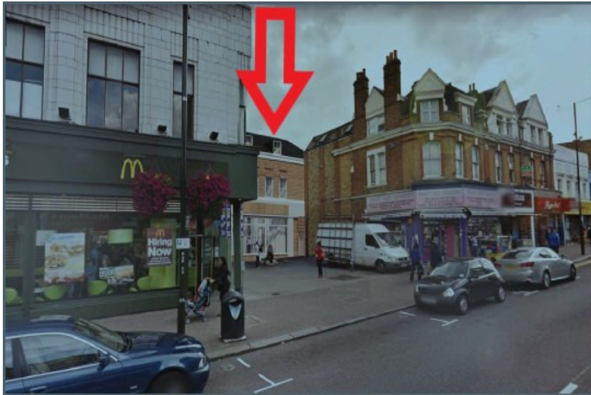
CGI of development

Penge, London, SE20 – Arpley Square, High Street